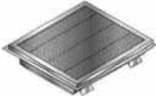
Stainless Steel Floor Trough with Subway Grating Non-Slip Fiberglass Grate also available