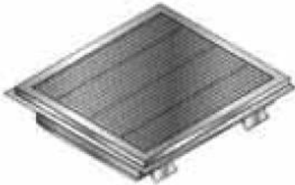
Anti-Splash Stainless Steel Floor Trough with Subway Grating Non-Slip Fiberglass Grate also available