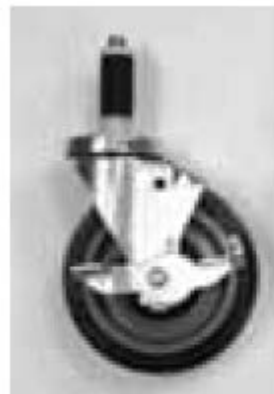
Swivel Caster with brake