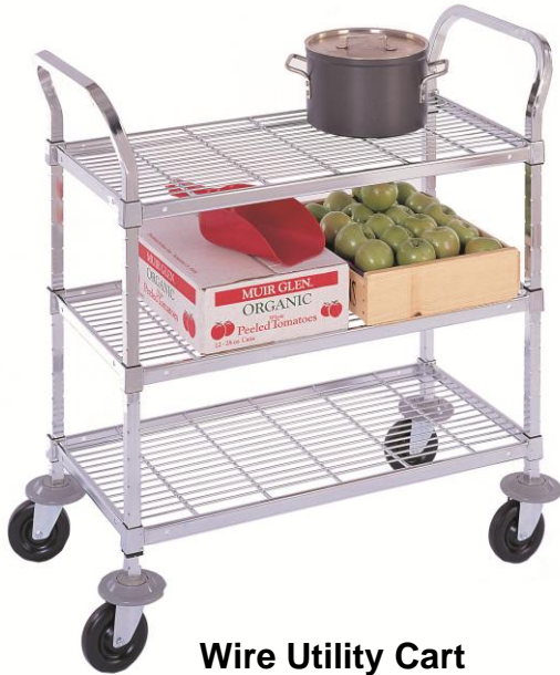
Wire Utility Cart

ITEM# _____ MODEL# _____ QTY: _____ PROJECT: _____