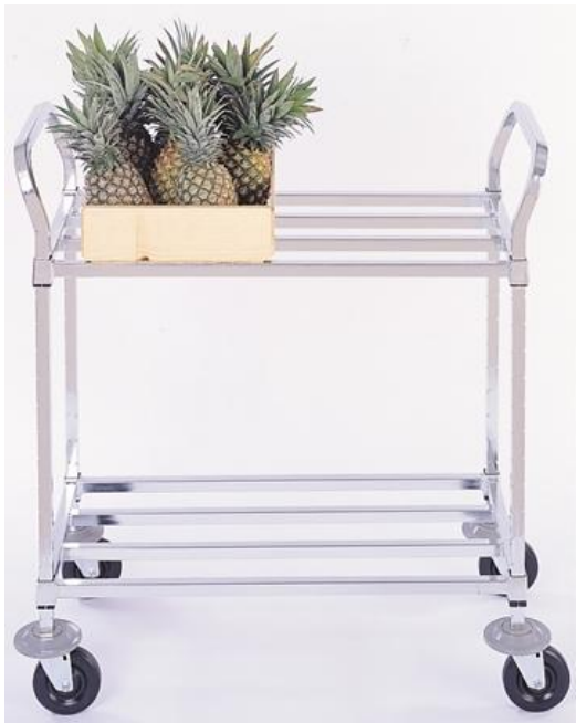
Heavy Duty Utility Cart