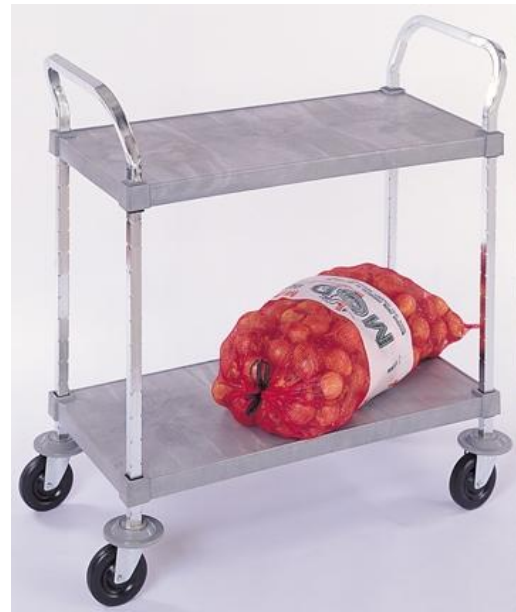
Plasteel® Utility Cart

For SPG's complete product menu, visit www.spgusa.com or call 877.503.4SPG (4774)