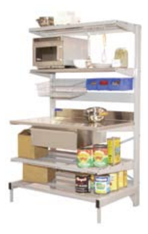
Freestyle™ Prep Station