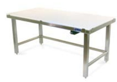
Universal Stainless Steel Adjustable Ergonomic Table