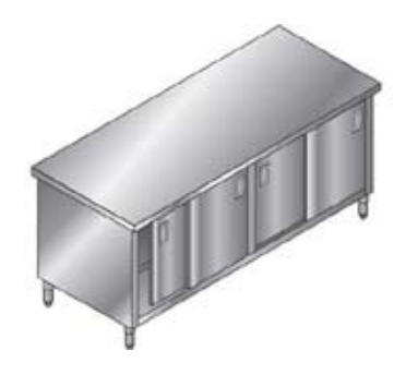
Universal Stainless Steel Cabinet