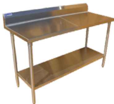
Universal Stainless Steel Work Table