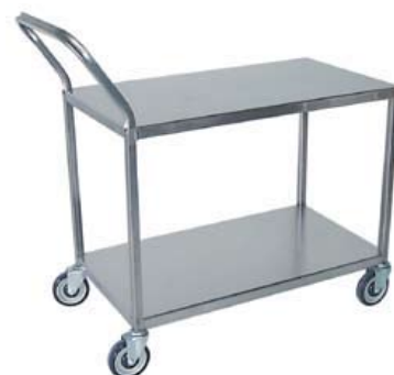
Kelmax Stainless Steel Utility Cart