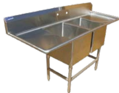
Universal Stainless Steel 2-Compartment Sink