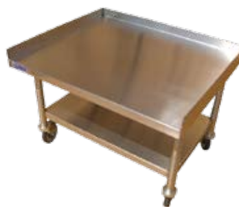
Universal Stainless Steel Equipment Stand