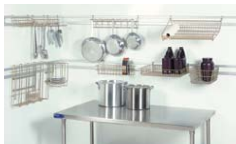
Wall Trax™ System