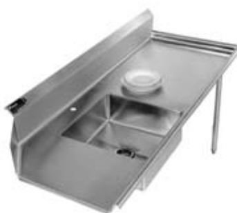
Universal Stainless Steel Soiled Dish Table