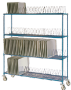
AMCO Tray Module Cart