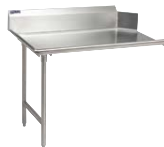
Universal Stainless Steel Clean Dish Table