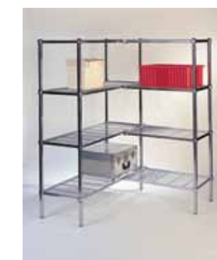
Standard Duty Wire Shelving