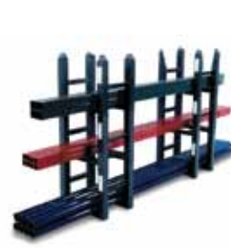
Mini-Module® Patented Stacking Racks