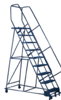
60° Standard Angle Ladders

With innovative features, proven durability and heavy duty construction, no one else offers you such a wide selection of rolling steel and fixed ladders. Or more ways to elevate the performance of your operation.