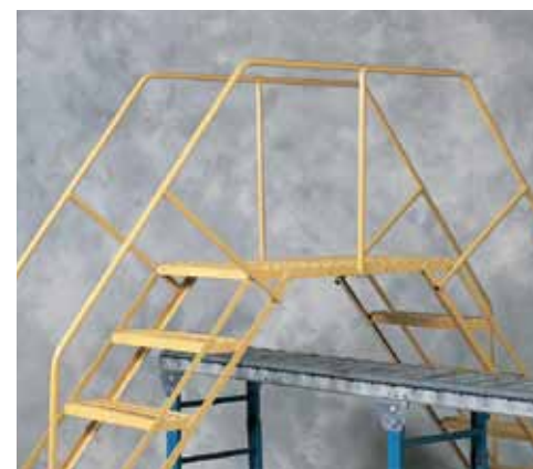
50° Crossover Ladders