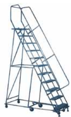
The Patented Gillis "6-Wheeler"™