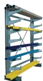
Quiktree® Light-Medium Duty Cantilever Racks