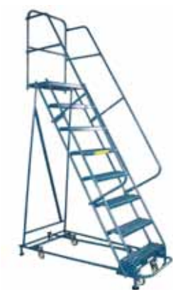
The New "Multi-Directional"™ Ladder