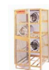
Cylinder Storage Cabinets