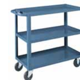
Rolling Service Stock Carts

Our wide selection of carts incorporates unique design features, quality construction, proven durability — and everything you need to push your business forward.