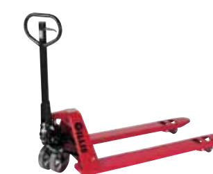
Hand Pallet Trucks