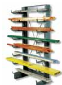
Minitree™ Light Duty Cantilever Racks

Below are a few examples of the wide array of styles, configurations and load capacities that Jarke offers for virtually any application. Each is designed and built to provide easy access to materials and maximum storage from every square inch in your facility.