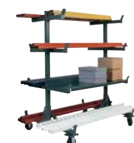
Mobile Pipe Carts

Visit spgusa.com to download our complete material handling catalog.