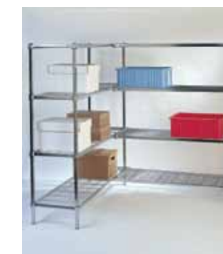
Heavy Duty Wire Shelving

SPG offers the industry's widest array of materials, components and accessories. That means we can provide a custom shelving solution for virtually any application — in any space — that's strong, versatile and easy to assemble.