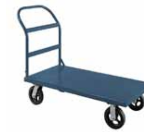
Heavy Duty All-Welded Platform Trucks