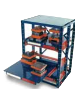
EZ-Glide™ Roll-Out Shelving