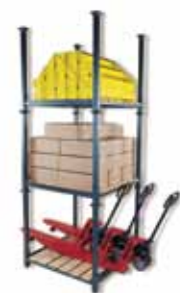
Airector® Stacking Racks